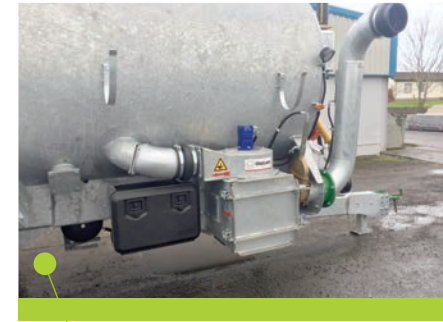
Inlet macerator MXL10000