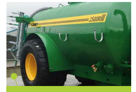
850/50 R30.5 Trelleborg tyres