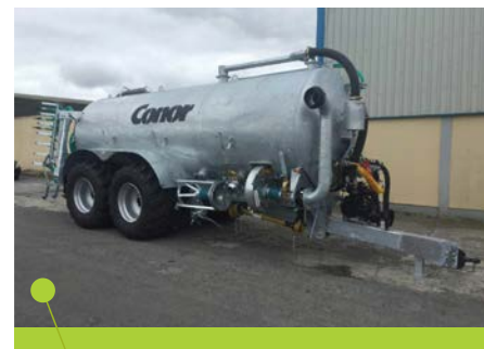
6" autofill with powerfill