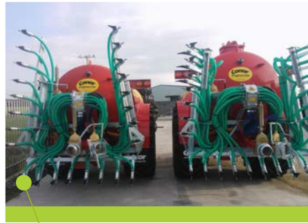
Standard axle v Stepped axle