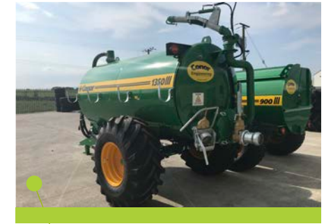
Adjustable rain gun piped to outlet