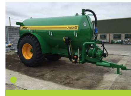
Garda EVO pump and DCI arm