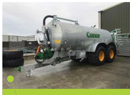
Weight transfer system