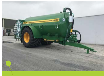
1050/50 R32 BKT RT600 tyres