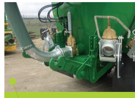
Hydraulic rear linkage