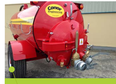
43" rear door