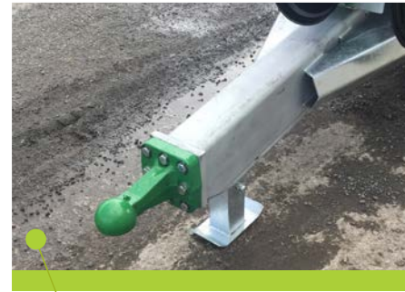
Bolt and spoon hitch