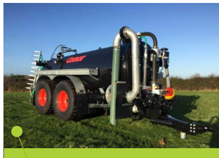
8" plunger arm