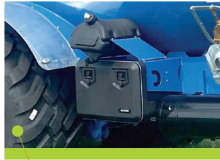
Hand wash tank and toolbox