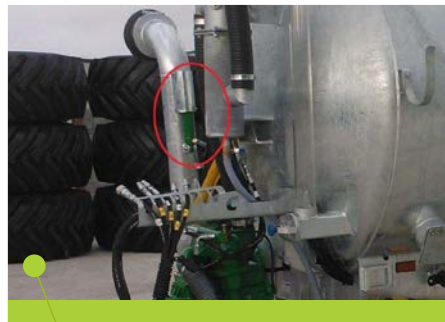
Vent ram on autofill