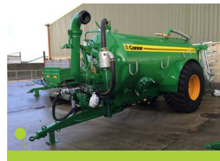
8" centre mounted autofill