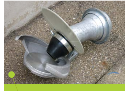
Eisele spreading plate