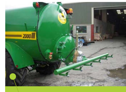
Dust suppression bar