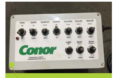
Electronic control box