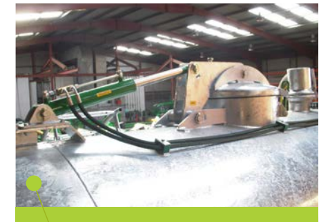
Hydraulic top hatch